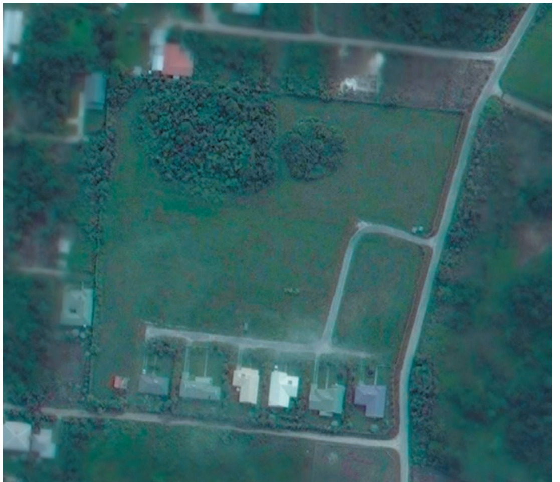
Sites ready to build!